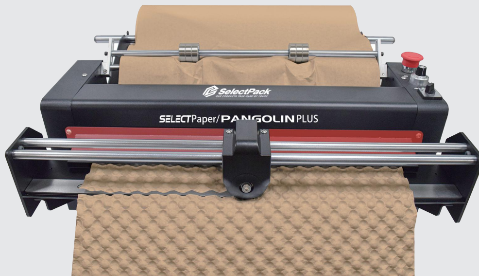
PANGOLINPLUS SUPPORT CUSTOM/MULTIPLE BUBBLE TYPES